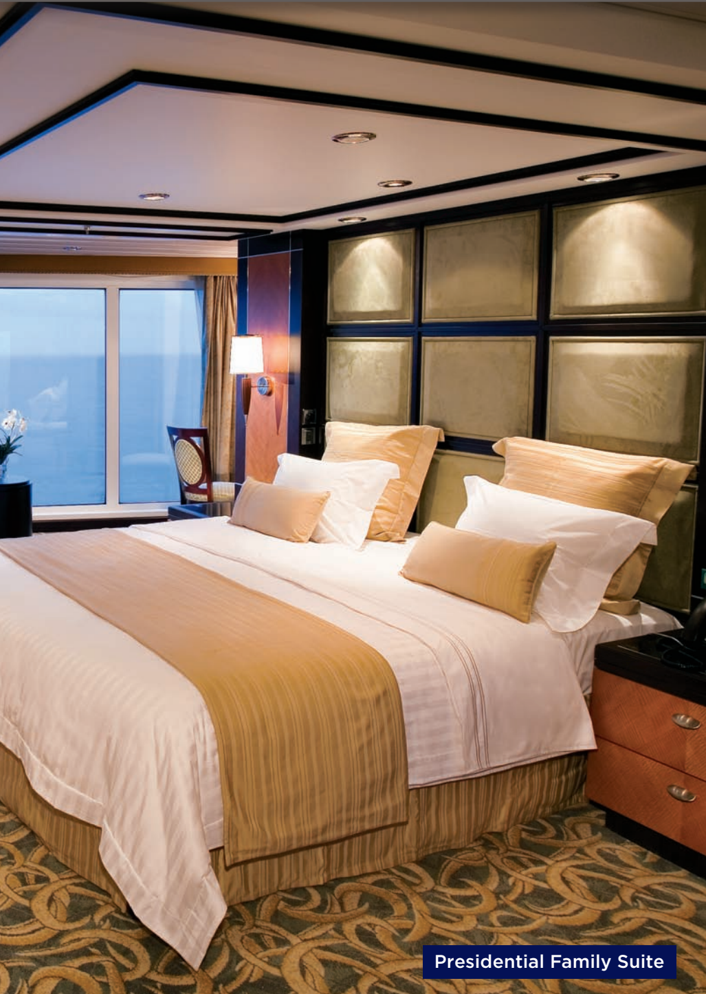
Presidential Family Suite

*Charges apply during 12 a.m. and 5 a.m.